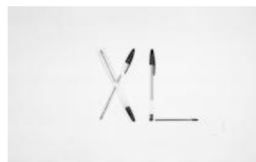
Ignacio Uriarte, XL (detail), 2009, Eighty black-and-white 35mm slides, Continuous loop.