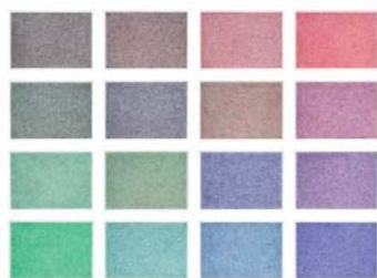
Ignacio Uriarte, BIC Transitions , 2010, BIC pen on paper, Sixteen drawings, each: 11 13/16 x 16 9/16 inches.