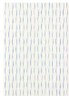
Ignacio Uriarte, Blue Wrist Suite , 2012. Ballpoint ink on paper, One of four drawings, each: 27 9/16 x 19 11/16 inches. Courtesy of the artist and Nogueras Blanchard, Barcelona. Photograph by Simon Vogel.