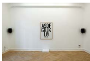
Ignacio Uriarte, ASDFGHJKLÖ , 2012, Ink jet poster and audio soundtrack, 51 3/16 x 37 7/16 inches, Audio duration: 32:28 min. Installation view of Arbeitsrhythmus , Figge von Rosen Galerie, Berlin.